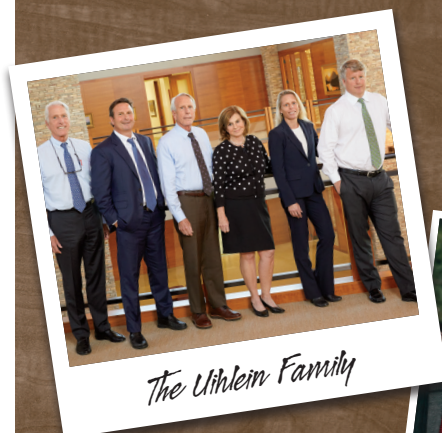
The Uihlein Family

We remain a family-run business built on a few core principles: the best products, selection and service you'll find anywhere. Today, we're a proud "family" of over 6,600 employees at 11 locations across North America to serve you.